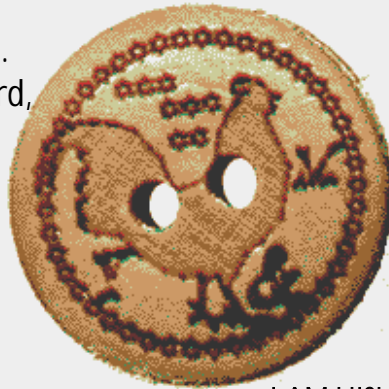
I AM HIS!

It may seem a small thing to some, a button to be sewn, Yet this desire of my heart was to the Godhead known. "I need to find that button, Lord, to sew upon these slacks I want to take to Emmaus. I wonder where it is."