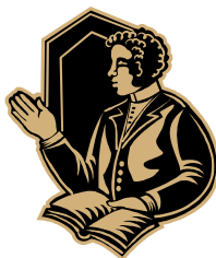
Table of Peter